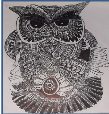
Priyanshu Das VIA