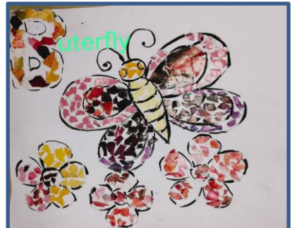
Isha Yadav VIII B