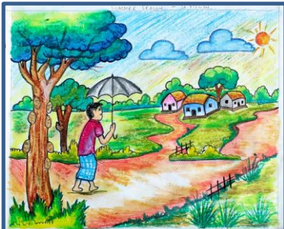
SK. Rizwan 2A