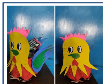
Craft made out of plastic bottle, Rakshan Shaw 4A