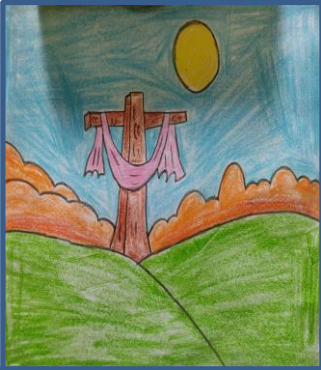
Aniket Shaw 2A