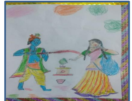
Rishika Shaw 3A